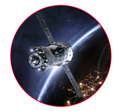
Space and Satellite Communications