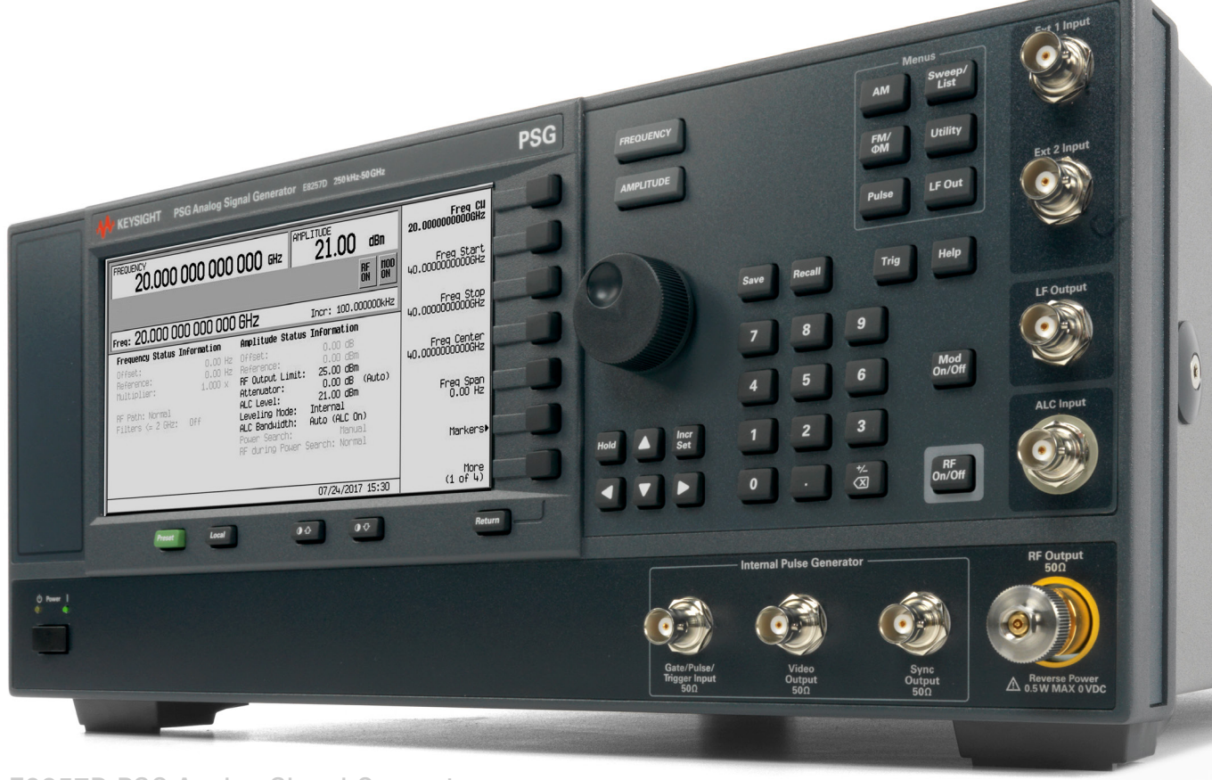
E8257D PSG Analog Signal Generator